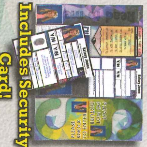
Includes Security Card!

Includes 1 high resolution, printable image with copyright release. Incluye 1 imagen imprimible de alta resolución y la liberación de derechos de autor